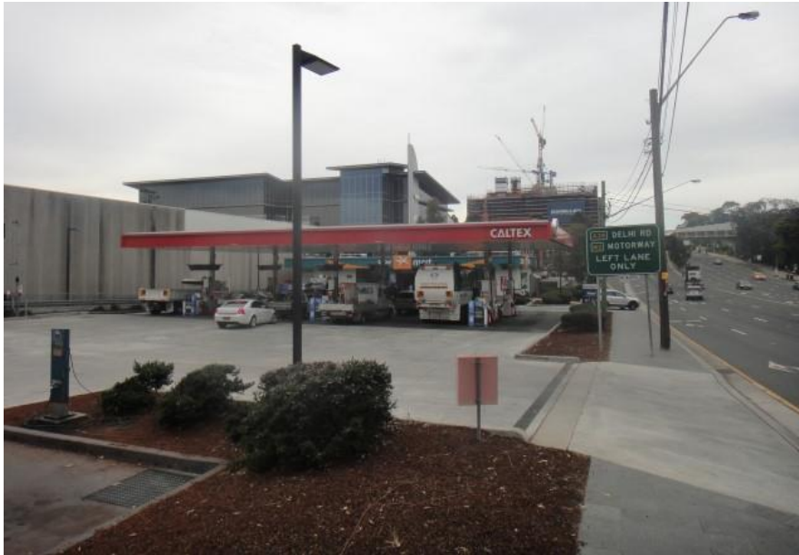
Image 8 - This Caltex servo at Macquarie Park is the site for the 2WS radio promotion. This promotion includes the offer of free fuel at this service station for any motorist for 1 hour between 10 am and 11 am. Promotion of the TV series “Mayans” will be made on air and by our assembly of motorcycles at this servo.