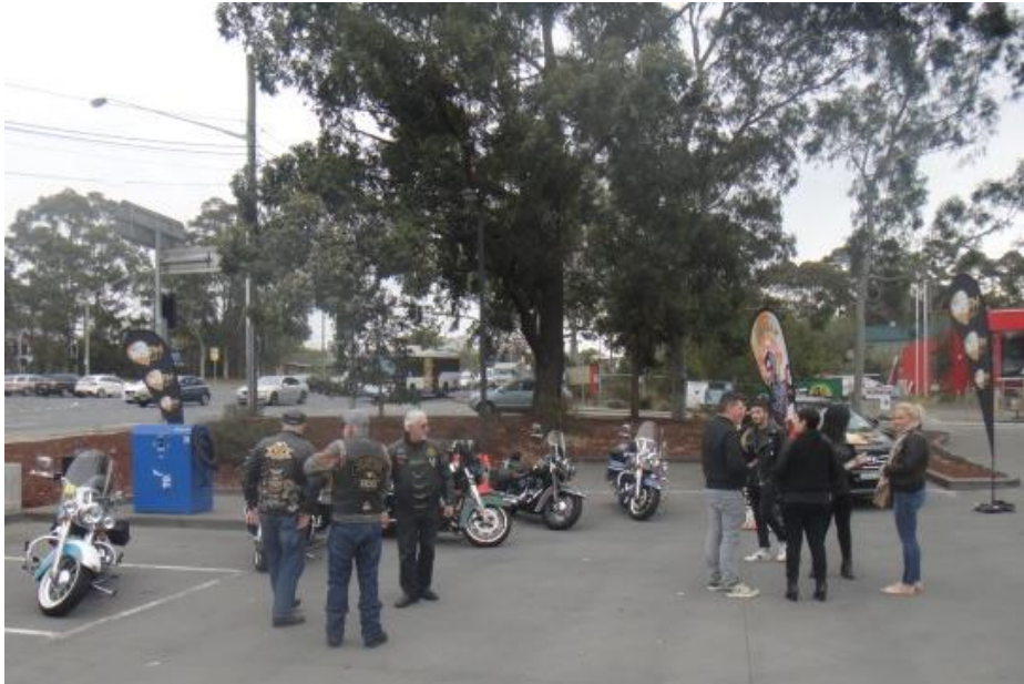
Image 10 - We are on site ahead of the scheduled arrival of 2WS radio personality Brendan Jones (more widely known as "Jonesy") at 10 am. Jonesy is an Australian radio presenter, media personality and motorcycling enthusiast. Radio staff can be seen on right of photo.