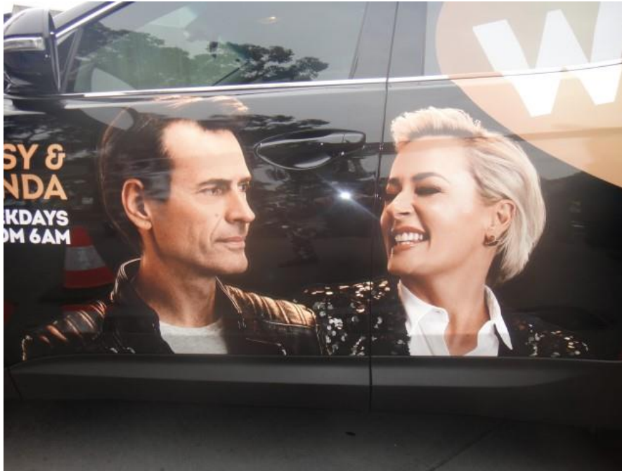
Image 12 - The side of the 2WS car featuring an image of its morning show hosts Jonesy & Amanda Keller. They can be heard weekdays from 6 am on frequency 101.7 FM and currently enjoy the number one rating on the FM network.