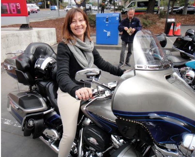
Image 22 – Every picture tells a story! All the girls loved the bikes!