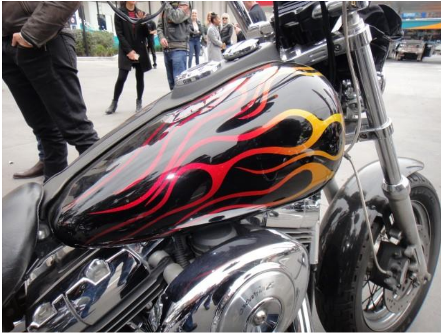
Image 16 - A close look at Jonesy's bike showing the impressive tank graphics.