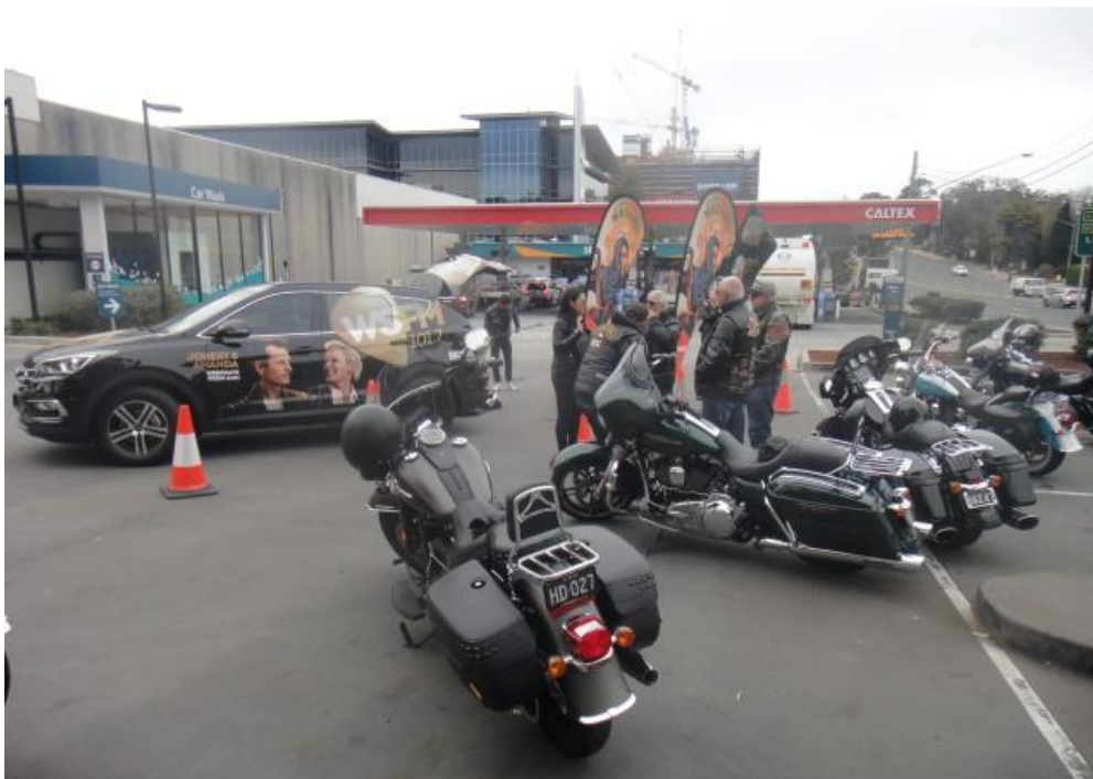
Image 11 - An image showing our impressive bikes and a 2WS-FM Radio car at left.