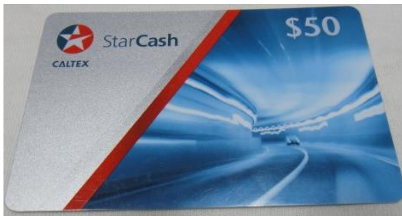
Image 27 – Surprise! Just before things were concluded we were each given a $50 cash card to spend at any Caltex servo. Ripper!

Image 26 - The other side of the pamphlet. It says: "Set in a post-Jax Teller world, follow the story of EZ – fresh out of prison and a prospect in the Mayans M. C. charter on the Cali/Mexi border, EZ must carve out his new identity in a town where he was once the golden boy with the American Dream in his grasp".