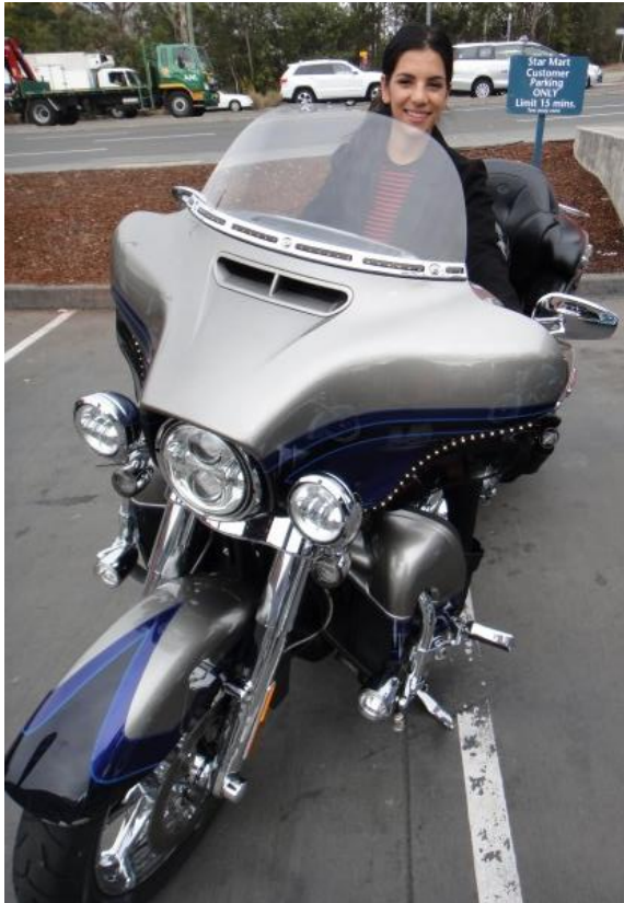
Image 20 - Radio crew were also quick to seize the opportunity of a Harley experience and were delighted to be allowed to sit on them as evidenced by their big smiles.