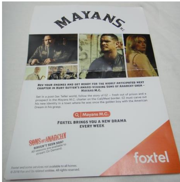
Image 26 - The other side of the pamphlet. It says: "Set in a post-Jax Teller world, follow the story of EZ – fresh out of prison and a prospect in the Mayans M. C. charter on the Cali/Mexi border, EZ must carve out his new identity in a town where he was once the golden boy with the American Dream in his grasp".