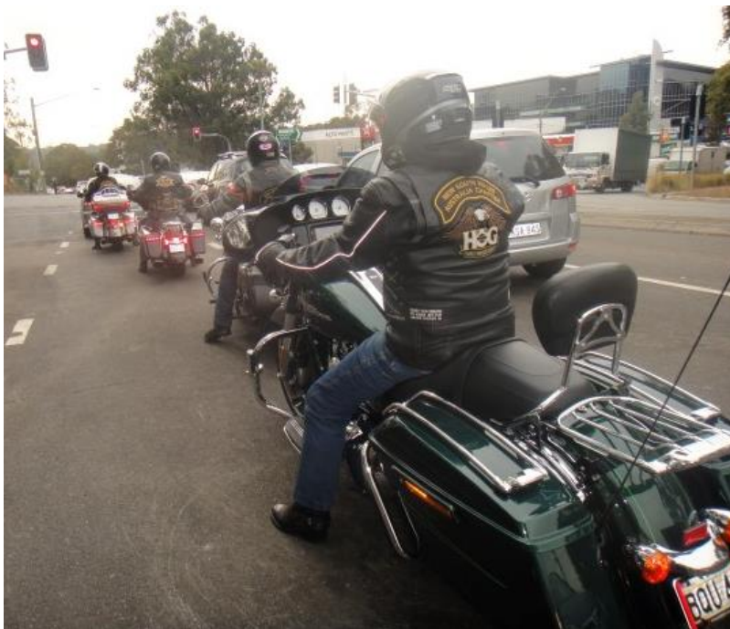
Image 7 - Again on our way the 6 of us head down Wicks Road and are about to turn right onto Epping Road with our destination the Caltex Service Station right at this intersection.