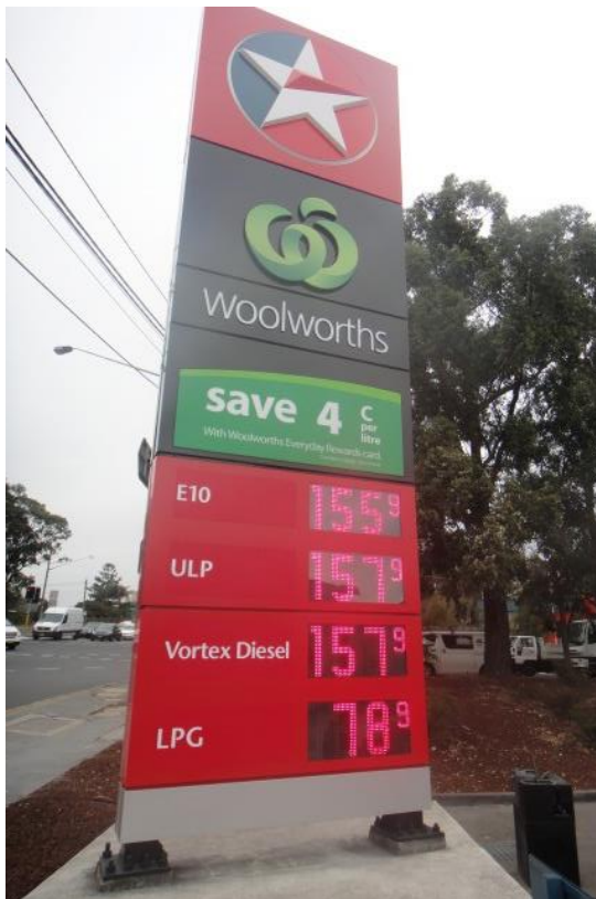
Image 9 - The price of fuel today is in the up cycle, expensive! Free fuel for motorists will be that much sweeter!