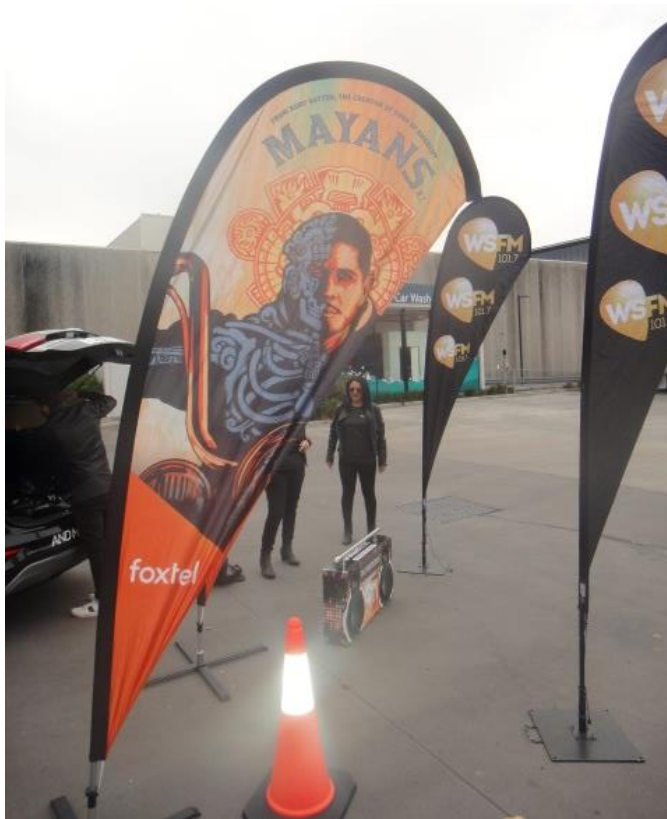
Image 13 - These banners are to promote the TV series “Mayans”, which is based around the Mayans M.C. (motorcycle club), hence the preference for the use of Harley-Davidson props.