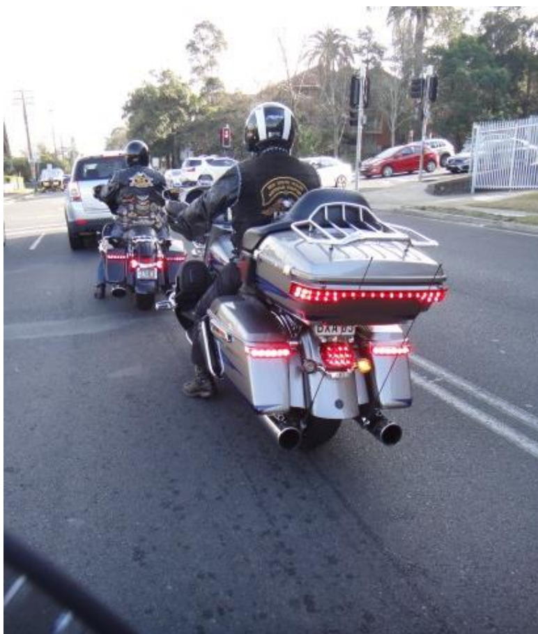
Image 3 – We head out in plenty of time and will meet up with 2 other Hoggies further down the road.