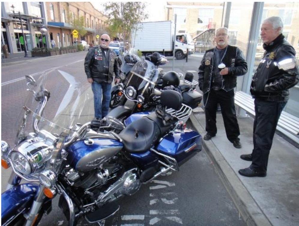
Image 1 – Within 5 minutes of accepting this gig the 4 requested motorcycles were organised and with 2 to spare just in case. We could have supplied even more but tried to stick with the brief.

We Hoggies were offered this gig and obviously were delighted to take part but we don't accept payment for our services as individuals as we are a group of volunteers as are indeed all HOG Chapter members. The budget will thus be accepted by our Chapter and used to fund Chapter activities.